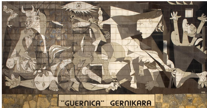
Guernica by Pablo Picasso, 1937

In support of a national inquiry into Missing and Murdered Indigenous Women